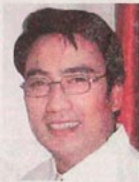
Sen. Bong Revilla